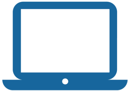
Thin clients PCs & laptops