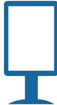
Kiosks & dynamic billboards