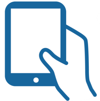
Tablets & mobile terminals